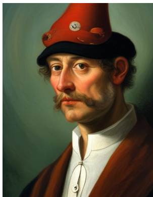
Figure 3: An image generated from the prompt, “Ehbruham Lynkon in a funny hat; portrait; historically accurate” using a version of the Stable Diffusion algorithm at nightcafe.studio

As evidence, consider figure 3. The prompt includes the deliberately obscure homophone “Ehbruham Lynkon”, and the output is not particularly like Lincoln at all. (The funny hat is rather more conspicuous than in figure 2, however.)