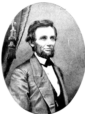
Figure 1: An 1861 photograph of Abraham Lincoln, reproduced in Ida Tarbell’s The Life of Abraham Lincoln [13, p. 101]. This digital image is extracted from a PDF file of a digital scan of the book.

be as many beauties lurking, unobserved, as there are flowers that blush unseen in forests and meadows” [6, p. 744]. A photograph does not rely upon and is not sensitive to the beliefs and attitudes of the photographer, at least not in the way that a painting or drawing is sensitive to the beliefs and attitudes of the artist. It is easier to imagine that the subject of a painted portrait is a myth than the subject of a photographic portrait. This is not because photographs cannot be faked, because of course they can. Rather, there is a sense that photographs present things more directly than paintings and other illustrations. For images which we know are fantastical, we nevertheless use the adjective “photorealistic” to mean how a thing actually would look— rather than how it would typically be drawn or painted.